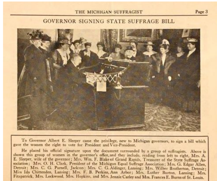
Michigan Governor Albert Sleeper and Suffragettes, c. 1910

Interested in visiting our museums? Call 313.833.1801 to book your trip.