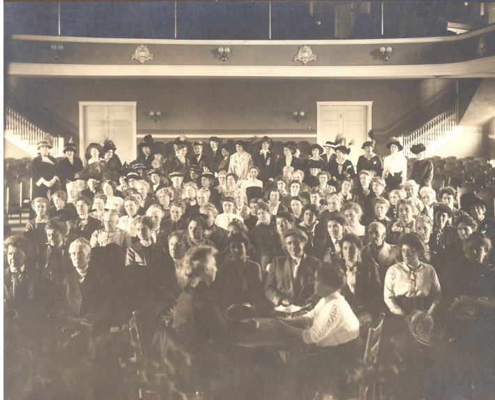
Women at convention for voting rights. c. 1909