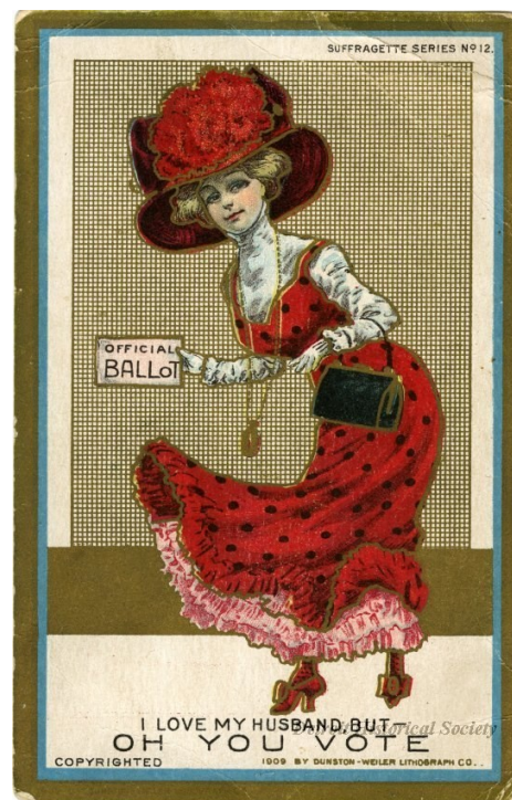
Postcard depicting a woman dressed in a polka dot dress with official ballot and caption "I love my husband, but—oh you vote". c. 1909