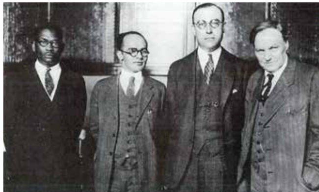
Henry Sweet and Attorneys Julian Perry, Tom Chawkes, and Clarence Darrow at the Time of the Second Sweet Trial

Courtesy of the Walter P. Reuther Library, Wayne State University