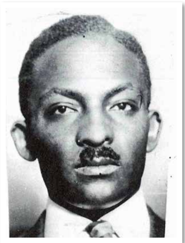
Dr. Ossian Sweet, 1925