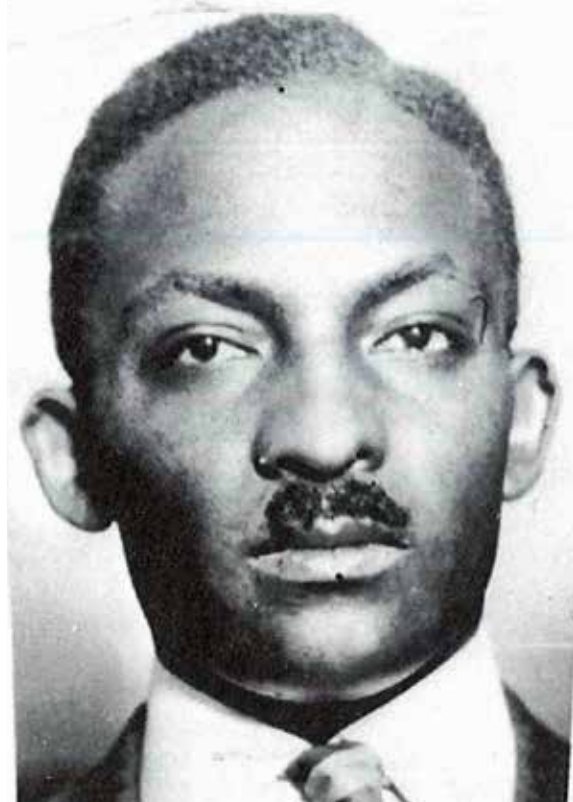
Dr. Ossian Sweet, 1925

Courtesy of the Walter P. Reuther Library, Wayne State University