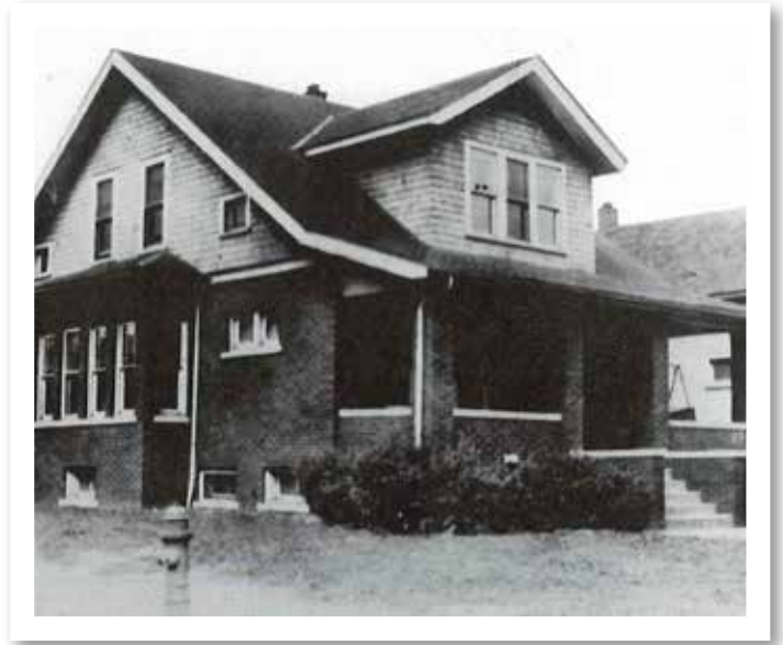
Ossian Sweet Home

Darrow insisted that the crowd was a mob with clearly malicious intents. The history of racial relations and tensions gave the Sweets every reason to believe that their property and lives were endangered and they were justified in acting accordingly.